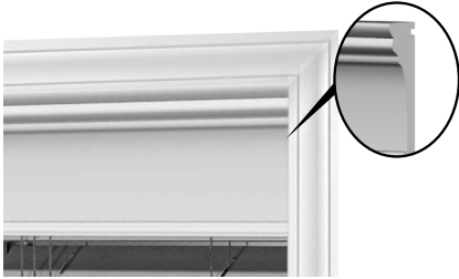
Full Recess Inside Mount Cornice

An Inside Mount Wood Cornice is manufactured with straight-cut edges on both ends and looks best when it is mounted flush to the window casing. The cornice width is determined by the width of the window treatment ordered.